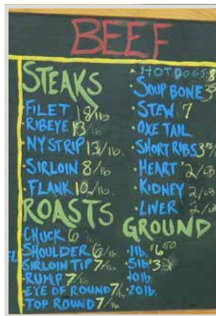
On-farm advertising: Attractive display helps create a local feel.

On-farm sales are probably the next most common form of retail sales. As the name implies, customers come directly to the farm to purchase meat. On-farm sales can work well in some situations because many potential consumers want to see the farms that they buy products from and see how the animals are raised. As a consequence, image is extremely important. Cleanliness and a neat premise are essential. Do things to emphasize the pastoral setting, contentment of animals, and