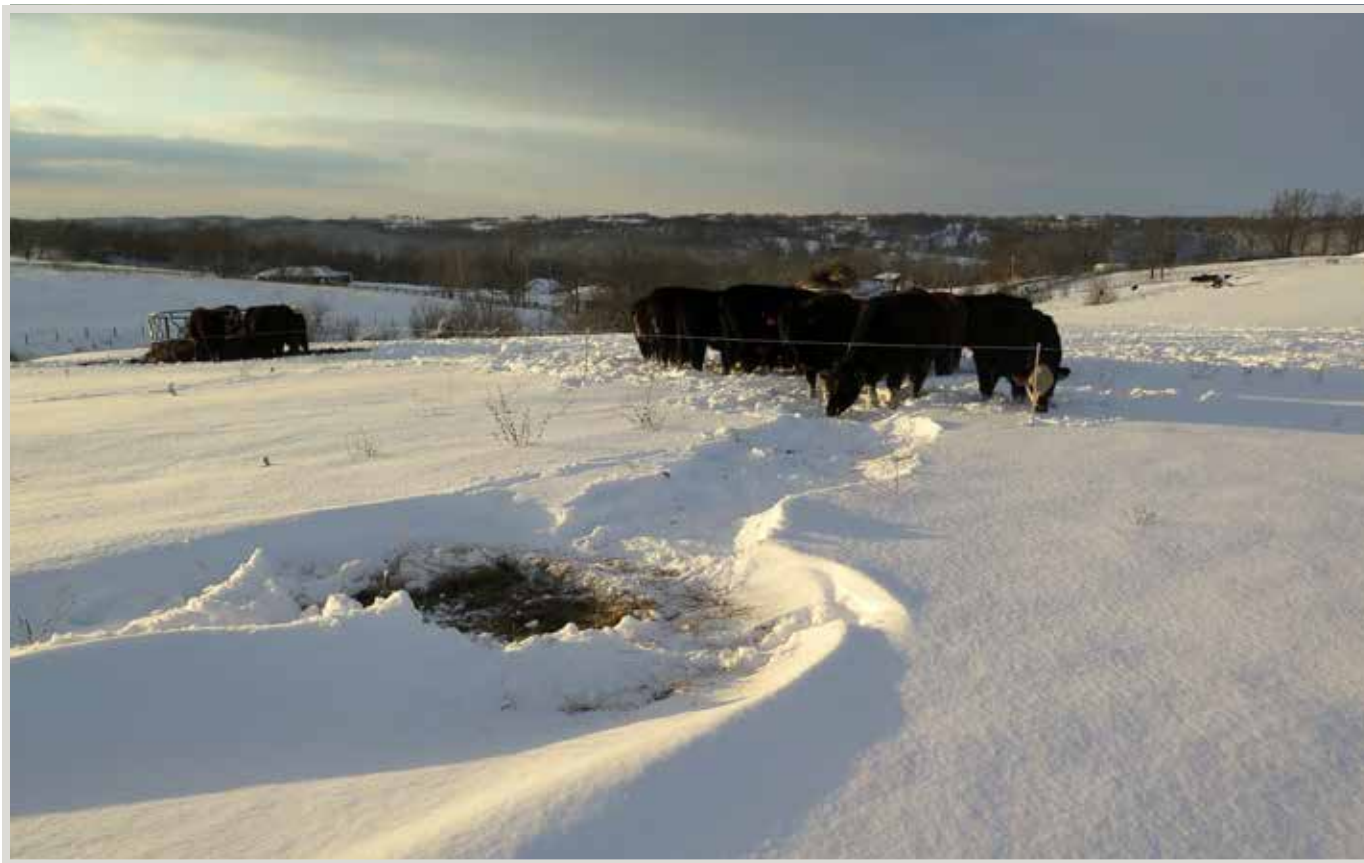
Yearling steers being fed hay in deep snow: Winter feeding is one of the biggest costs for finishing animals on pasture.