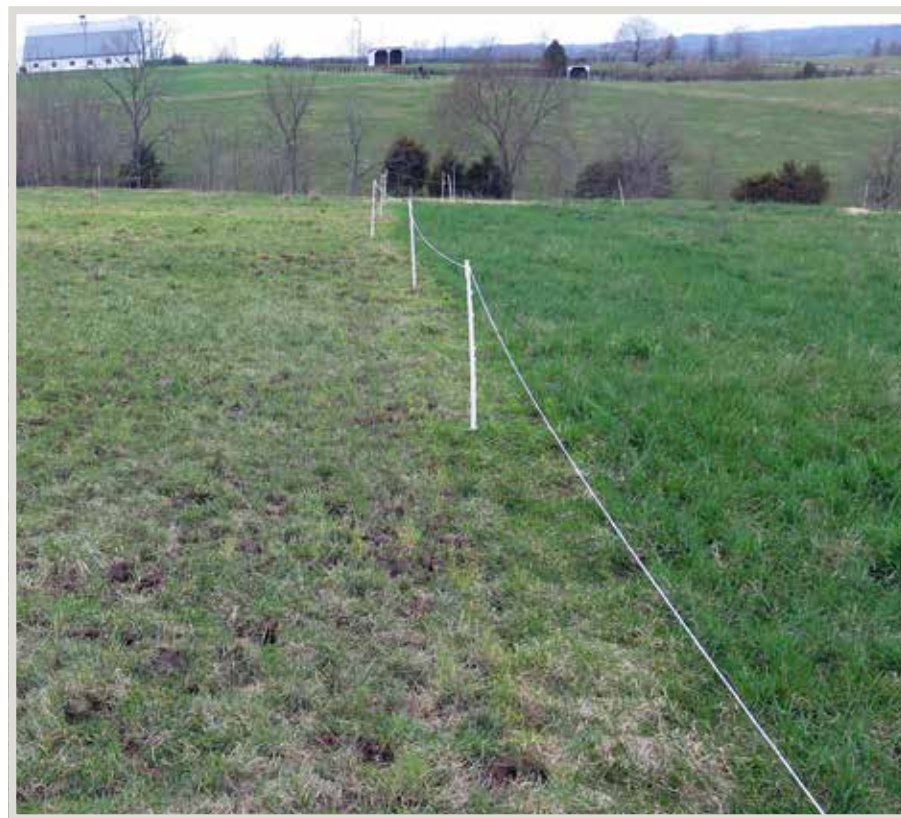
Late winter grazing of cereal rye: Cereal grains have excellent forage quality at this time of year.

to fill the summer slump. Although there is much variation on forage quality between the summer annuals, they will generally produce better gains during the summer compared to perennial pastures. Summer annuals should only be used on good soils with low soil erosion potential.