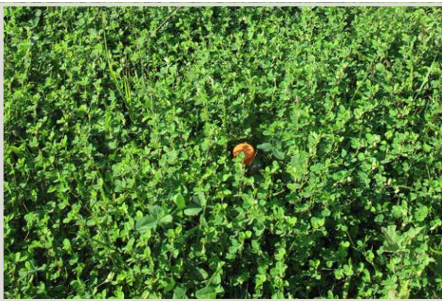
Annual lespedeza: Good stand of annual lespedeza in mid-July that was frost seeding into pasture in late winter. Lespedeza is an excellent quality forage for use in July and August.