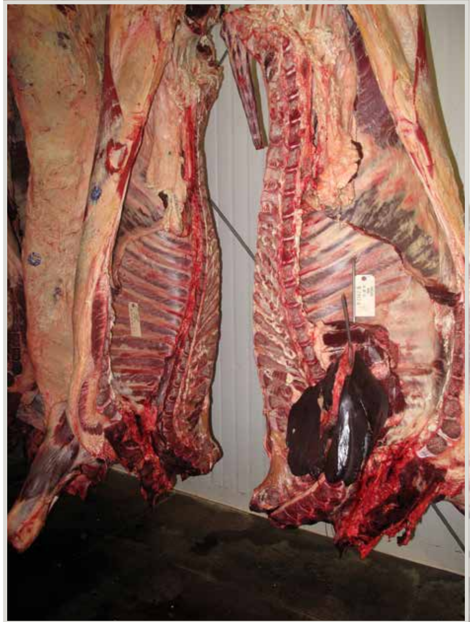
How finished is this carcass? A 736-pound carcass from an 1,195-pound liveweight grass-finished steer. The steer graded low select and yielded 522 pounds of wrapped meat (not including by-products).

Selling freezer beef is often an easier option than selling individual retail cuts, but it requires the most consumer education. Freezer beef is a term used when individuals wish to purchase a whole, half, or quarter of a beef carcass. This option has the