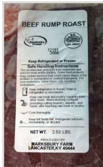
USDA inspected beef: This is the processor's label that can also be used for selling retail cuts.

Label Submission and Approval System (LSAS) ( http://www.fsis.usda.gov/wps/portal/fsis/topics/regulatory-compliance/labeling/labeling-procedures/label-submission-and-approval-system/lsas )