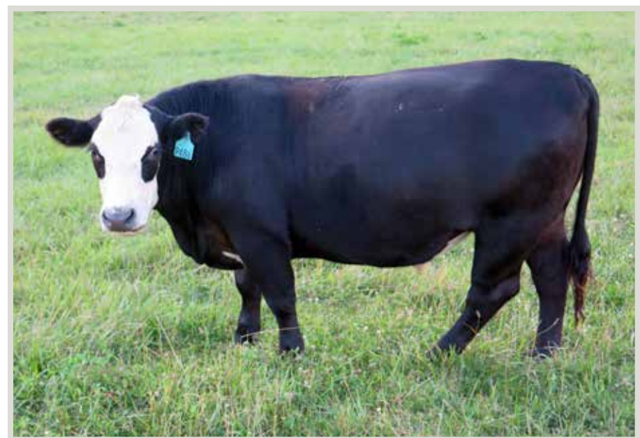
An ideal grass-finishing phenotype steer: Moderate-small frame height but deep, thick body. This steer is probably finished at this point but will go another three months before harvest.

Most cow-calf producers are familiar with body condition scores. Body condition scoring of beef cows ranges from 1 (an emaciated animal) to 9 (an animal that is excessively conditioned). This system can be