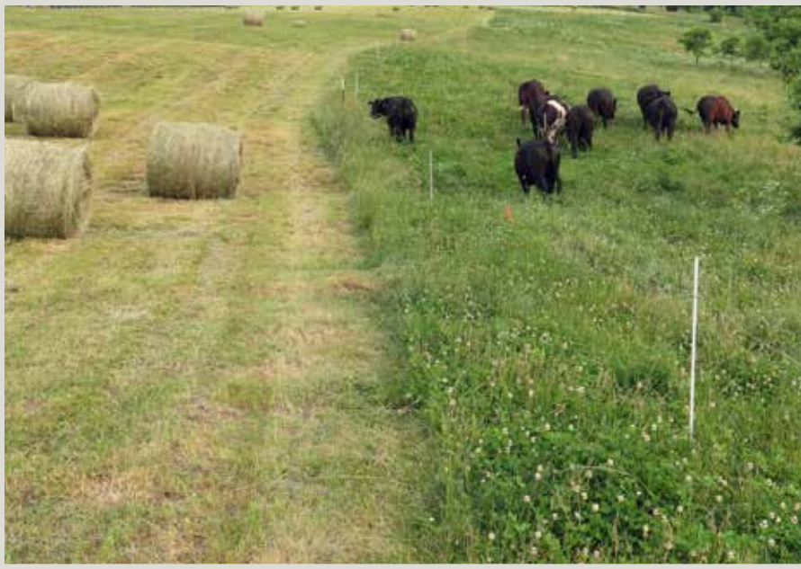
Making hay from excess pasture: This pasture was grazed twice in early spring, set aside for six weeks, and cut for hay in early June. Quality was excellent compared to traditional hay cut at this time.

harvesting grass at the boot stage rather than the late flowering stage will increase the gain potential of the hay.