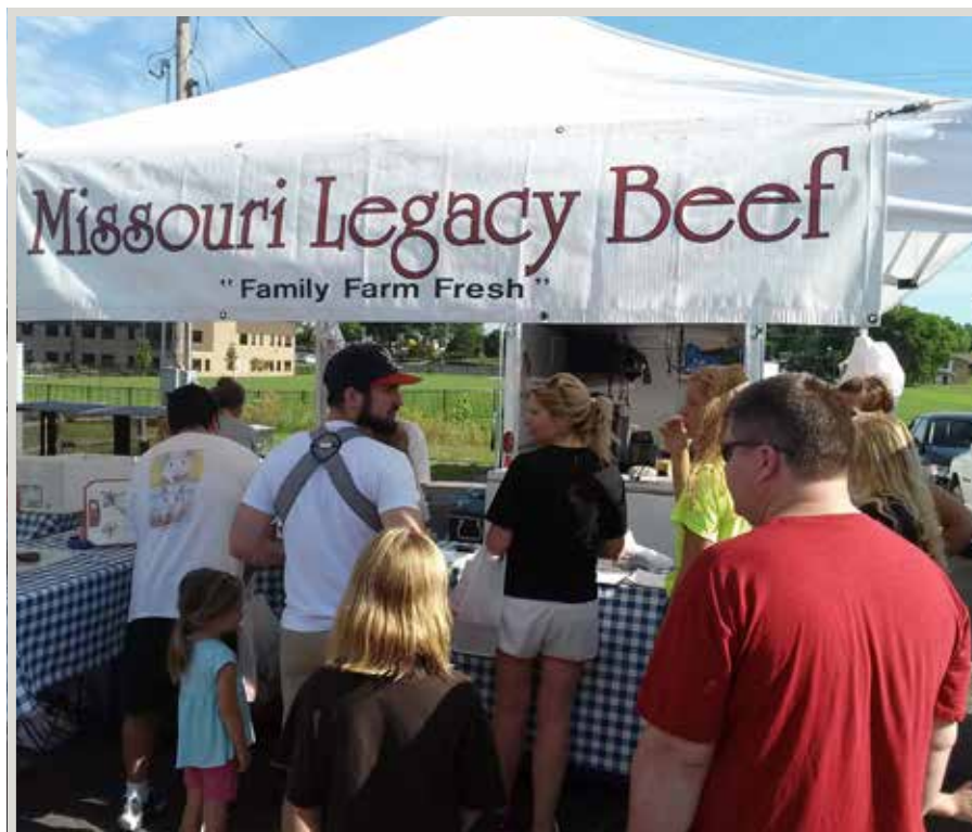
Selling locally produced beef at farmers markets has becoming increasingly popular in recent years.

Given all these constraints and challenges, freezer beef is still a great way to get started with pasture-finishing cattle. It is possible to sell a thousand pounds of meat while only dealing with six to eight different customers. You may be able to use only word-of-mouth advertising and not have to hold a single package of meat in inventory.