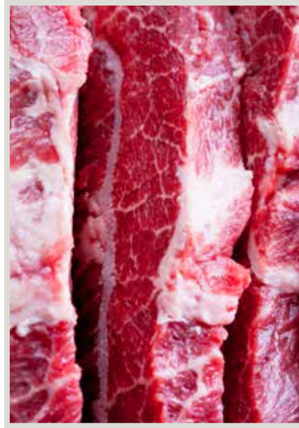
Good marbling is possible in pasture-based finishing systems with proper management.

Marbling refers to the flecks of fat inside the muscle, and the observed amount determines the USDA beef quality grade. The age of the animal at the time of harvest and the amount of marbling present in the ribeye at the 12th/13th rib interface are used to calculate the USDA beef quality grade. The age of the animal at the time of harvest predicts the potential tenderness of the meat, as the steaks and roasts will be tougher from older animals (>30 months). The amount of marbling, predicts