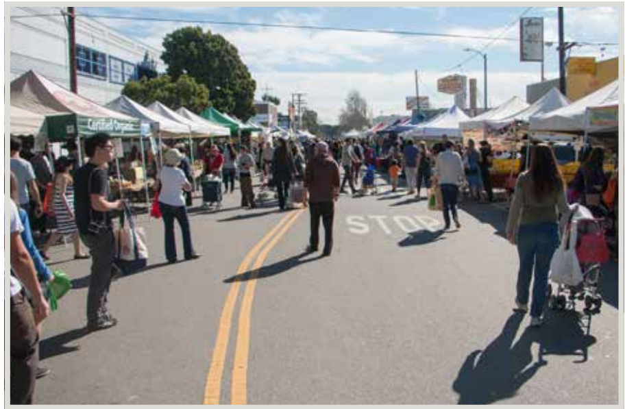
Farmers market: A great place to find customers looking for pasture-finished beef.

What an animal was fed and how it was aged can influence the flavor of your beef. The majority of the beef consumed in the United States is grain-fed and wet-aged. Farmers promoting forage-fed beef will need to educate their customers about the flavor. Forage-fed beef has a different flavor profile than traditional grain-fed beef due to the forages the animals consumed. Also beef purchased from a grocery store has been wet aged, meaning the carcass was fabricated into wholesale primal cuts 24 hours postmortem, sealed in a vacuum bag, placed in a box, and aged during transportation to the grocery store. Local meat processors will generally only dry-age beef. Dry-aged beef has a flavor that has been described as nuttier or earthier when compared to traditional wet-aging. Once again, customers will need to be educated on the flavor and aroma difference of dry-aged beef.