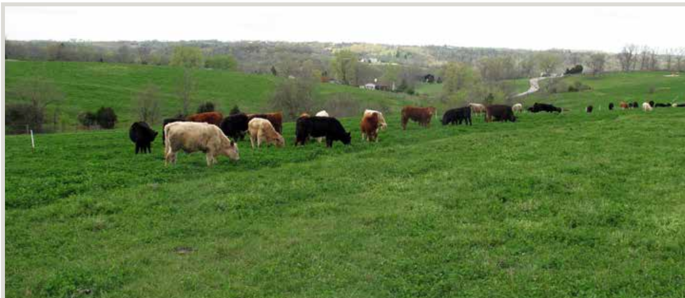
Rotational grazing calves in early spring: Cattle should be moved quickly in spring to avoid the last paddocks in the grazing system becoming overmature.

paddock system. For finishing animals, it was determined that a grazing residual of at least four inches should be left when animals are moved out of the paddock to maintain a high plane of energy intake.