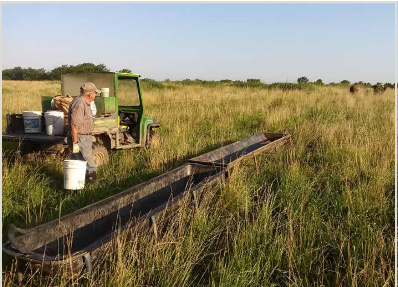
Grain supplementation: Supplementing a pasture diet with grain allows for an earlier harvest and more consistent finishing quality. The earlier harvest is particularly important with spring-born calves that you are trying to finish before their second winter.

The grain-on-grass production process varies widely. Grain-on-grass systems as described in this publication assume that no more than half of total energy intake is from concentrates and that animals will at minimum be grazing pastures during periods of active vegetative growth. This process generally means 1.0 percent or less concentrate intake on a dry matter basis based on bodyweight. Typically, finishing cattle offered a high concentrate diet have an average total intake ranging from 2.25 to 2.75 percent of body weight on a dry matter basis. Higher grain feeding levels will for practical purposes more closely resemble a feedlot diet. However, there are some producers who grow calves on forage during the grazing season followed by 60