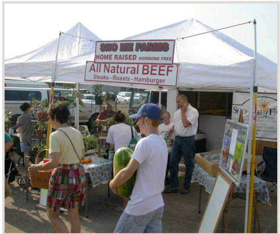
Naturally raised beef has become a popular market segment in recent years.

What exactly defines “local” is not clear. To some individuals, it will mean the small community they live in. For others, it may mean being in