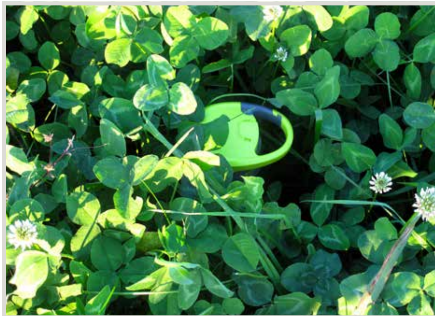
Ideal mix of clover/grass for finishing cattle: Pasture sward 8 to 12 inches tall with lots of clover has potential for high gains.

Seeding alfalfa into tall fescue stands will also increase animal performance and, due to its deeper root system, provide better summer production compared to other cool-season forages. Well-managed alfalfa-grass stands increase both quality and yield of the pasture, greatly improving overall production. Grazing varieties of alfalfa have been developed, but hay varieties can be utilized successfully under