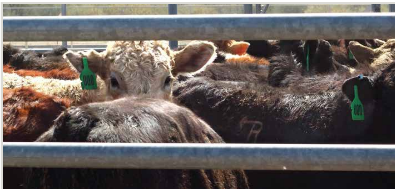
Wholesale beef cattle market.

with these activities. You will also typically sell at a lower price and have a lower profit potential on a per animal basis, but this method allows you to concentrate on the production side and let someone else worry about the processing and marketing. Thus, wholesale markets may be a viable option if you are good at finishing cattle but do not want to do the marketing to sell a final product.