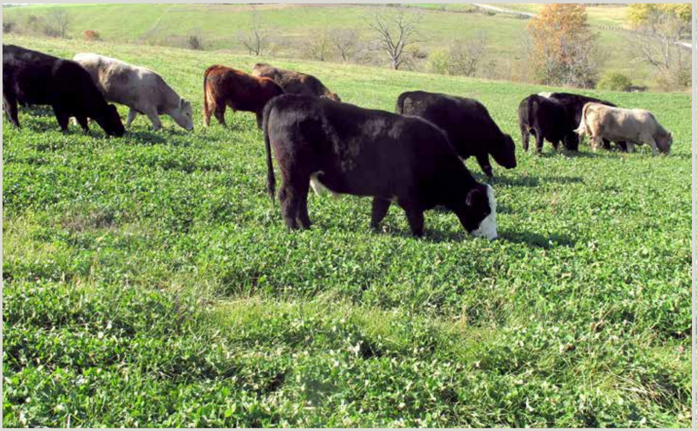
Eight to nine hundred pound steers grazing in early November: Fall-born calves from the previous year with good management will easily finish by the next fall (23 to 26 months old).

Although most cow herds could be characterized as spring or fall calving, undefined or year-round calving is still fairly common. This calving option provides distribution of calves for finishing and marketing throughout the year. However, this system results in management and marketing difficulties (for the commodity market) and is typically discouraged.