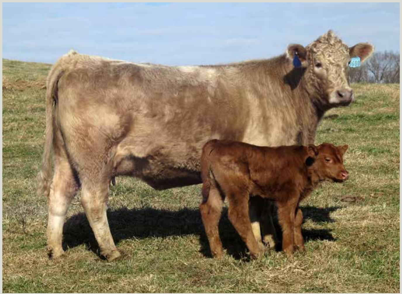
Kentucky beauty: The ideal grass-finishing phenotype cow with a moderate-small frame height and deep, thick body. Her first calf is standing by her side.

as the Lowline, Jersey, or Dexter may best suited to this system. In between these two extremes are a variety of breeds that would work well (see Table 5). Identifying genetics that will work for your system also requires being productive under the environmental conditions in your region. For example, breeds or genetic lines that do not shed their winter hair coat in spring will experience greater heat stress and lower performance during the summer months in hot humid regions of the upper south.