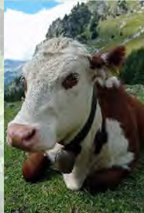
Vacant Director Harrisonburg